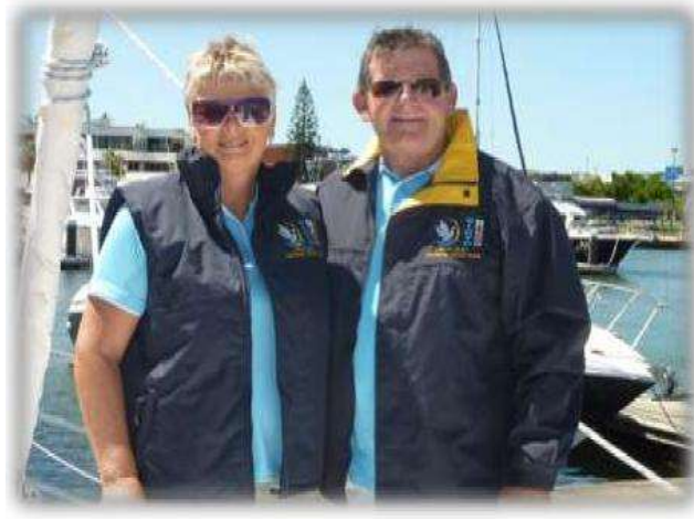
Vest $64 Delivered