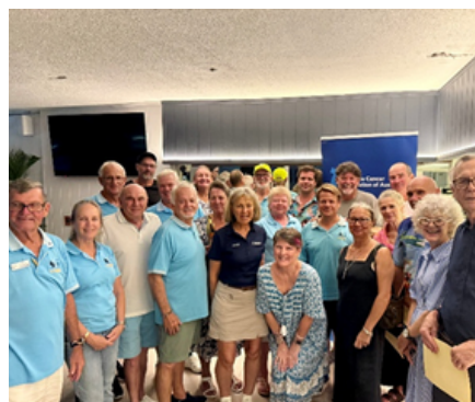
Group photo of sponsors