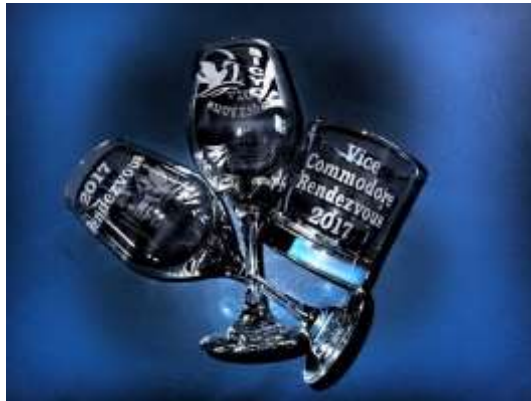
Rendezvous Scotch and Wine Glasses $12 at the Memoribillia Stand

ORDERS TAKEN FOR SICYC JACKETS $130 including postage and handling