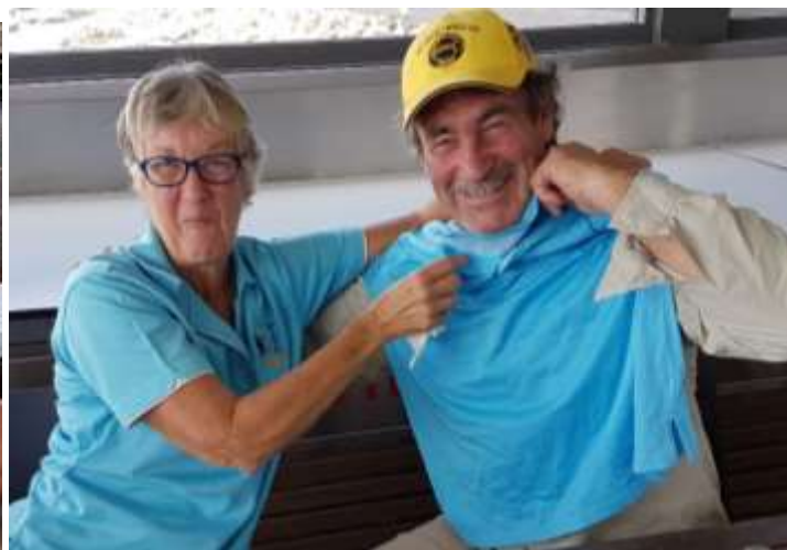
A small but happy bunch..