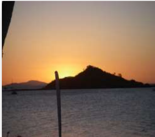
Shag Islet at Sunset