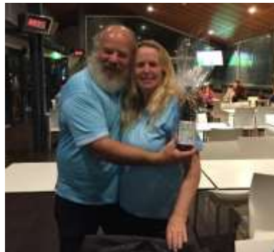
Faces from near and far...

If you are in the Brisbane area, drop into the Moreton Bay Trailer Boat Club on the last Friday of each Month .. The next one will be 31 July ..