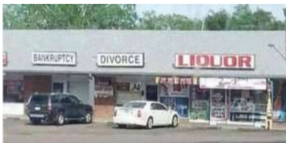
Location, Location, Location