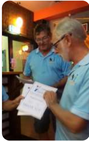
Shingley Beach Resort