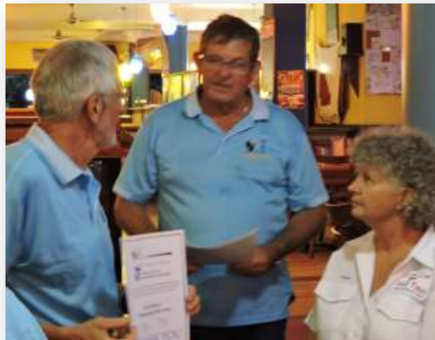
Whitsunday Heli Taxis