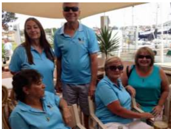
A lovely Spot