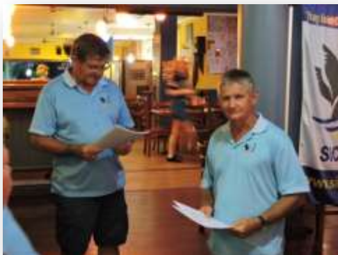
Cumberland Charter Yachts