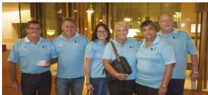
Some of the “Vice Commodores” who attended the presentation