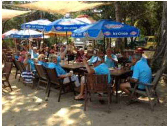
The Hydeaway Bay and Dingo Beach "Vice Commodores" having lunch and a drink at the Dingo Beach Pub and planning for the 2014 rendezvous..