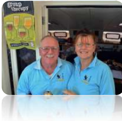
VC Savusavu & VC Rangiroa, French Polynesia .. sailing " Around The Block "

After an epic passage leaving from Brisbane QLD in May 2012, stopping at many places on the trip round, including the 2012 SICYC Rendezvous, we have made it to Fremantle and have met up with several of the SICYC Westie's members.