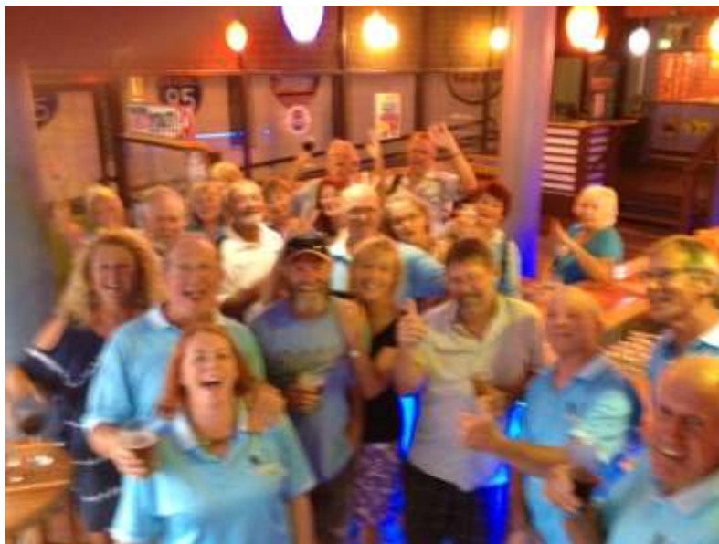
SUNDOWNERS at Hogs Breath Airlie Beach ...