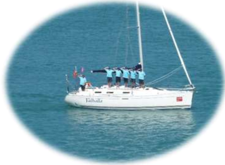
Valhalla ... the SICYC entry in the Hammo Race Week .. Taking the salute in uniform Naturally !!!!