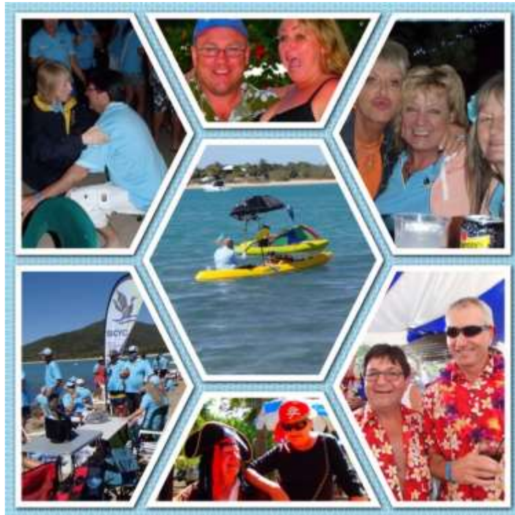
A photo set taken by Rossie "Vice Commodore" Wavebreak Island at the Rendezvous