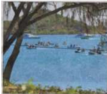
COMING ASHORE. Boats coming to shore to the call of the drums at the Shag Inlet Cruising Yacht Club's rendezvous at Hyalens Bay on the weekend.