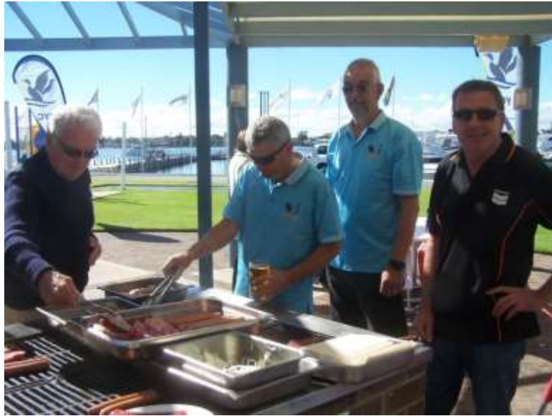
Well Done Westies