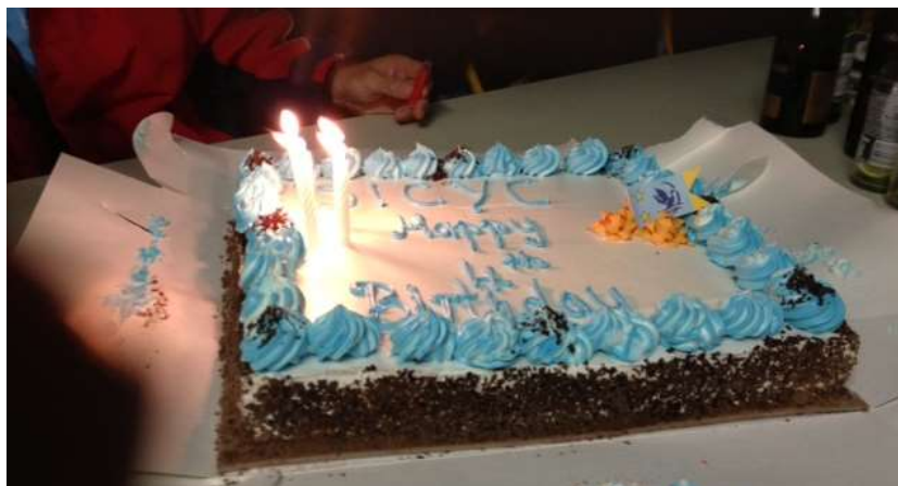
The 4 th Birthday Cake