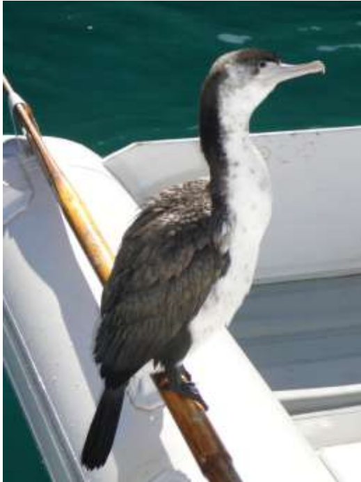
A Shag on a boat