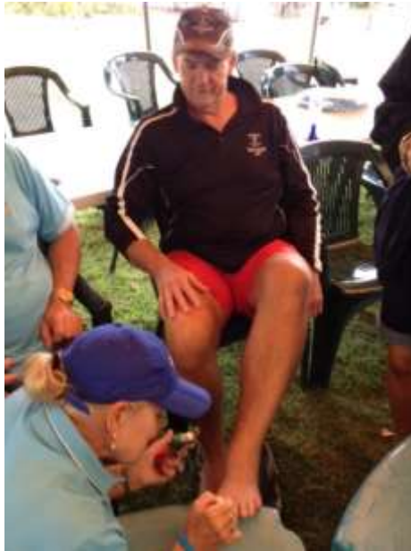
Port and Starboard Toe Nail Painting