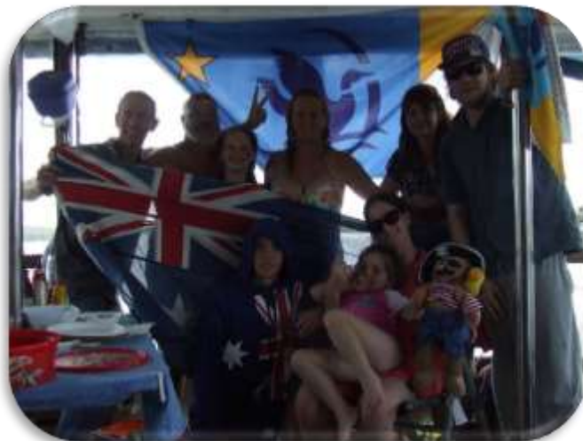
Celebrating Australia Day at Pacific Harbour on MV Kuzi